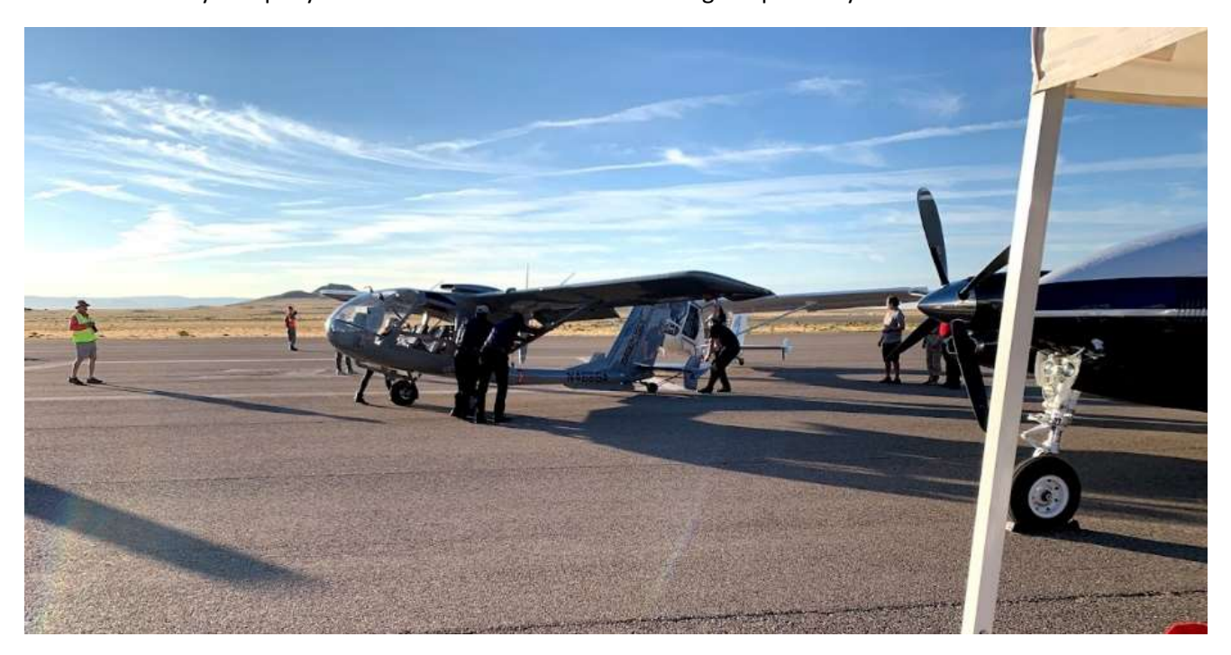
[Two of CSI's Seeker Aircraft from their subsidiary company, Seeker Aircraft]

In addition to one of our King Airs, CSI also brought two of its Seeker Aircraft. Seeker Aircraft is a wholly owned subsidiary company of CSI Aviation Inc. Seekers are designed primarily for surveillance.