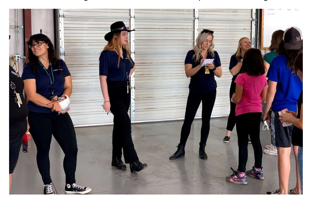
[Girls coming up to ask questions to CSI crew members as part of their scavenger hunt]

CSI's representatives spoke to the girls gathered for GIAD about their position and how they got to where they are in their careers today. Afterwards, the girls were released to complete a scavenger hunt, which included asking one of CSI's crew members a question in exchange for a stamp.