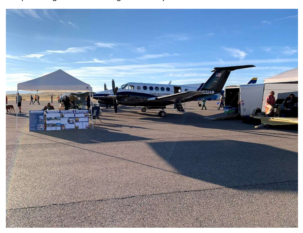
[CSI Aviation Inc.'s plane and booth, situated in the center of the day's line up]

CSI Aviation Inc. participated in the 2021 Land of Enchantment Fly-In, hosted by EAA Chapter 179 at Double Eagle II Airport in Albuquerque, NM on September 25th. CSI's Beechcraft King Air 300 (N532AW) was parked right next to the stage to be this year's showcase aircraft.